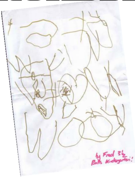
by Fred 3 1/2 Bulls Kindergarten!

Many thanks for all the many wonderful letters and drawings from budding young writers and artists from all over New Zealand. Keep up the fantastic work.