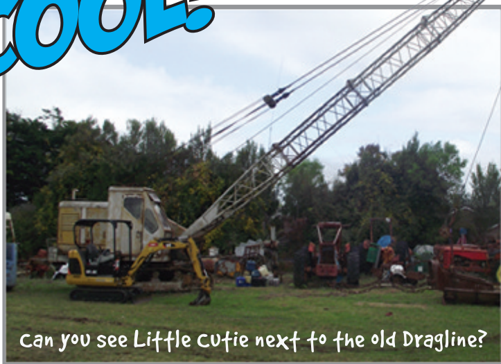
Can you see Little Cutie next to the old Dragline?