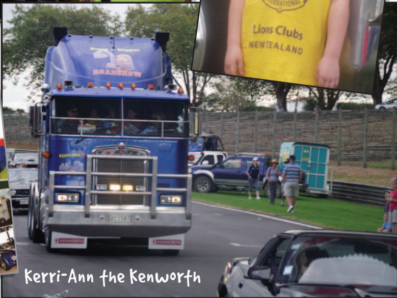
Kerri-Ann the Kenworth