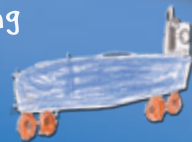
Izack's picture of Kerri-Ann

Izack - Rata Street School, Naenae, Lower Hutt