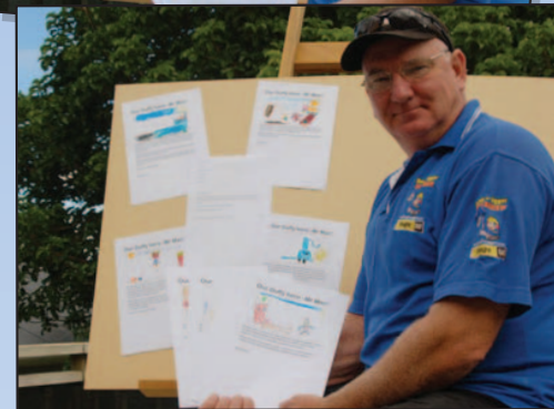
Some awesome work from Room 4 (top) and Room 7 (bottom) sent in by Rata Street School in Naenae, Lower Hutt.